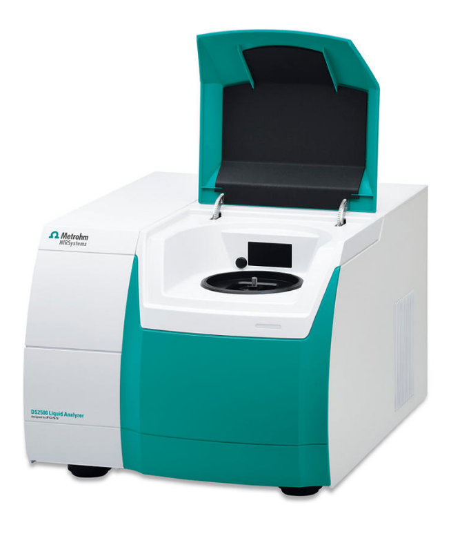
Figure 1. Metrohm DS2500 Liquid Analyzer used for the determination of research octane number (RON) in isomerate samples.