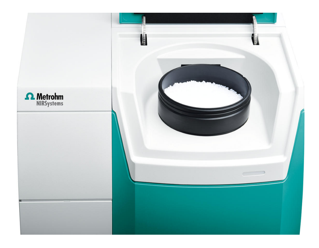
Figure 1. Metrohm DS2500 Solid Analyzer with the DS2500 large sample cup for measuring the intrinsic viscosity of recycled polyethylene terephthalate (rPET).

spectra. This setup with the large sample cup reduces the influence of the particle size distribution of the polymer pellets ( Figure 1 ). Data acquisition and prediction model development was performed with the software package Vision Air Complete.