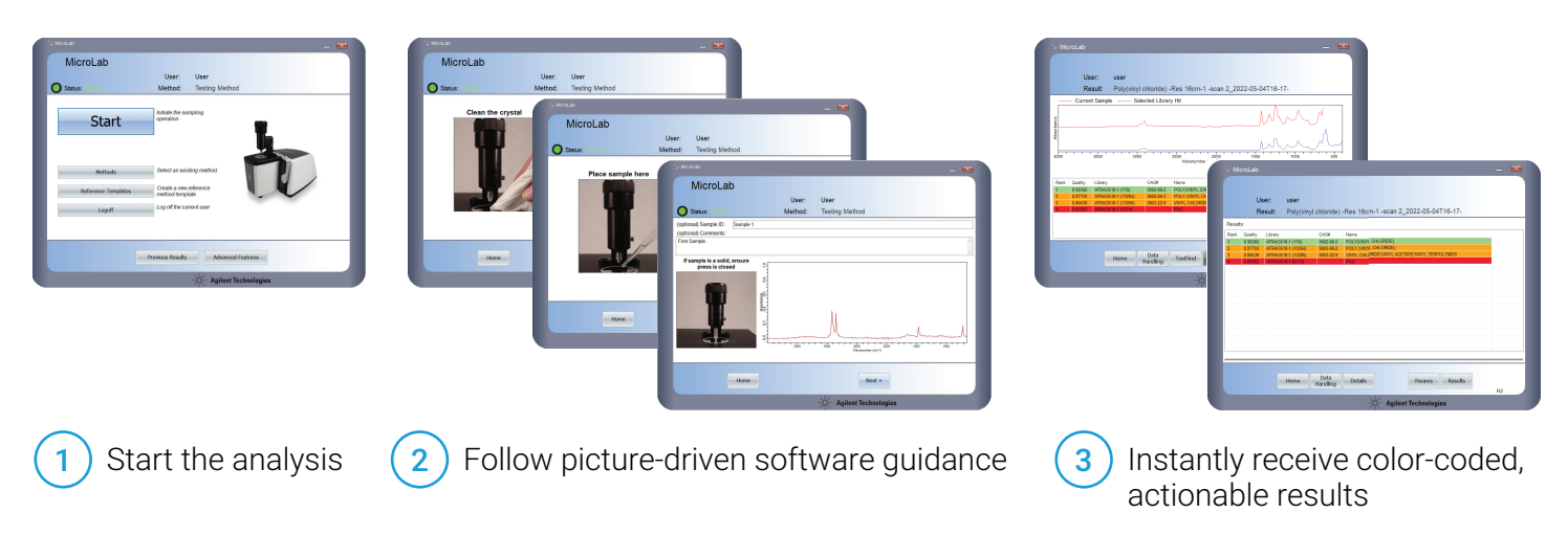
Figure 3. The intuitive Agilent MicroLab software makes finding answers with the Agilent Cary 630 FTIR spectrometer as easy as 1, 2, 3. The picture-driven software also reduces training needs and minimizes the risk of user-based errors.