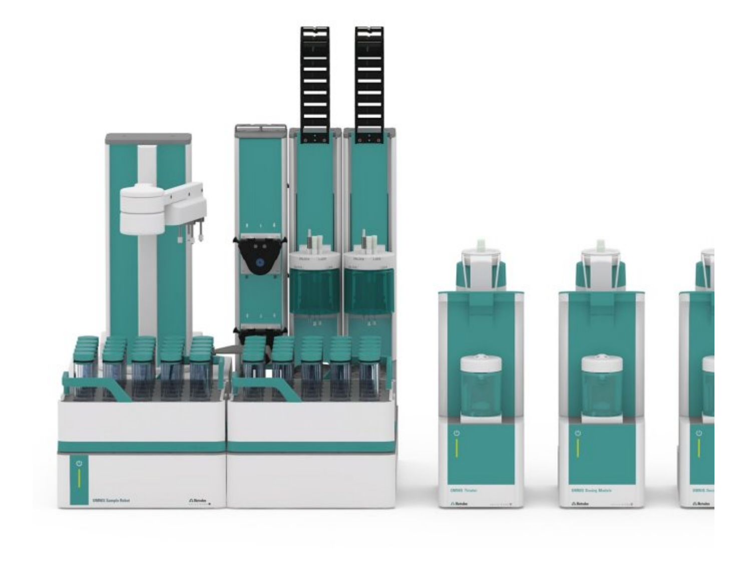
Figure 1. Automated OMNIS System for the parallel volumetric Karl Fischer titration and aqueous acid-base titration consisting of an OMNIS Sample Robot, OMNIS Dosing Module, and OMNIS Titrator Professional equipped with a Pt-wire electrode for automated systems and a dEcotrode plus.