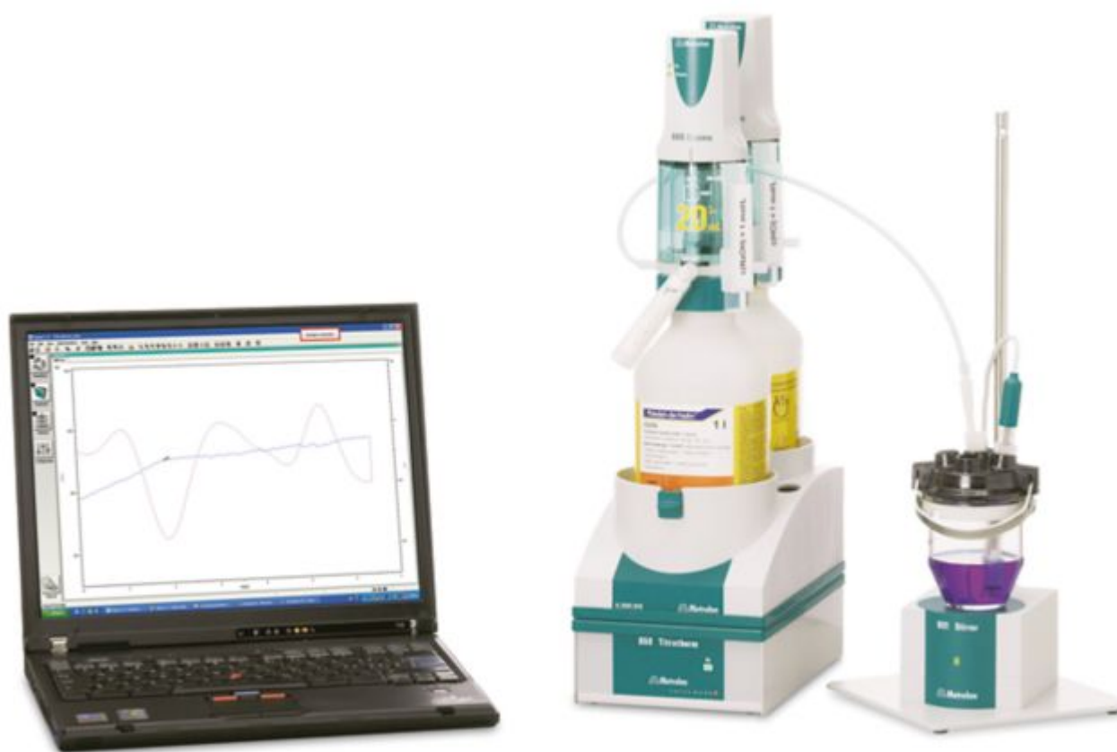
Figure 1. 859 Titrotherm setup for the thermometric titration and the data evaluation performed with tiamo.

The analysis is carried out with an 859 Titrotherm equipped with a Thermoprobe. To avoid handling chemicals manually, all solutions are automatically dosed using an 846 Dosing Interface.