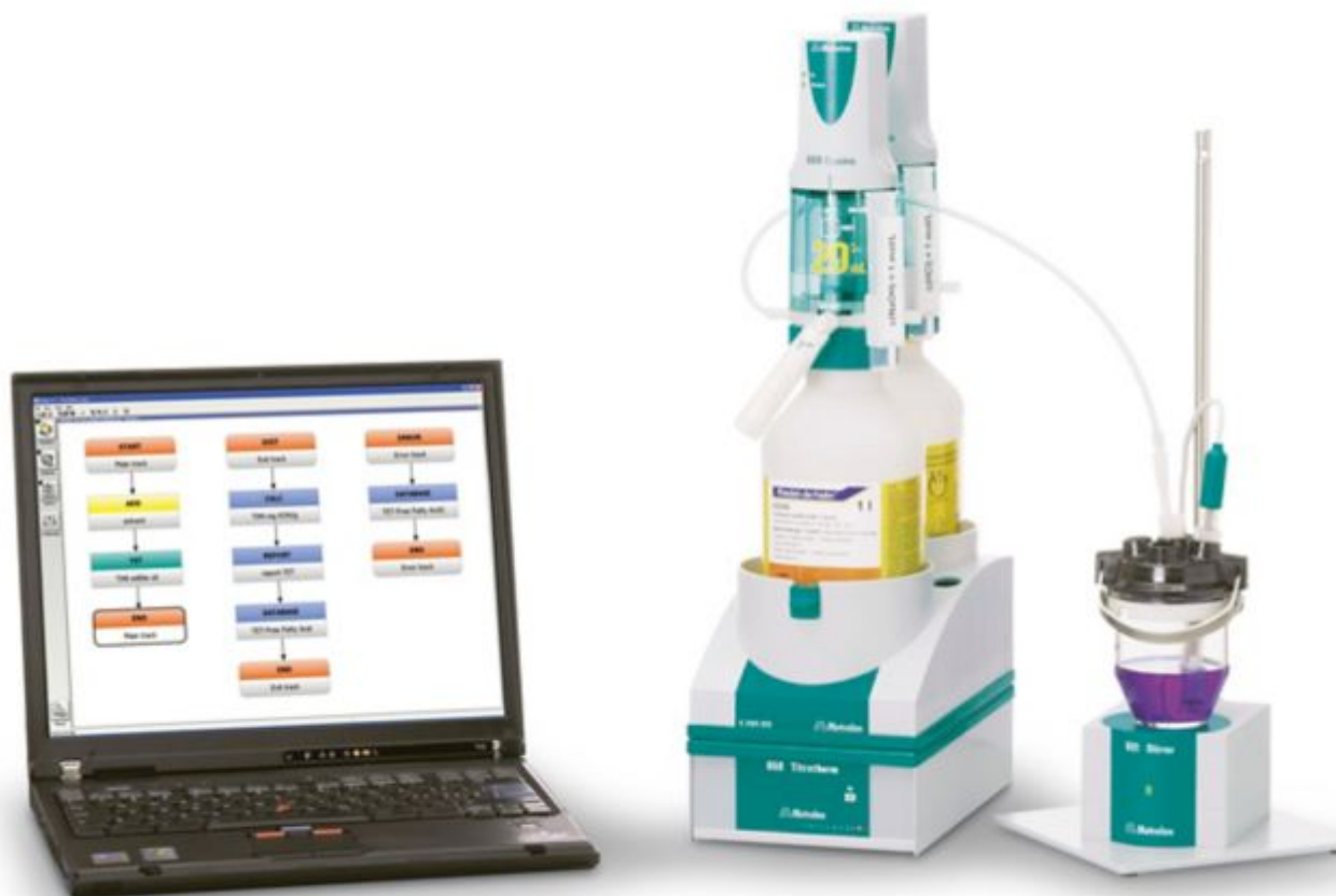
Figure 1. 859 Titrator equipped with a Thermoprobe and tiamo. Example setup for the analysis of aluminum.

After allowing to cool down to room temperature, an aliquot of the solution is used for titration. Ammonia buffer and hydrogen peroxide are added subsequently. The excess of EDTA is back titrated with \text{Cu}^{2+} solution.