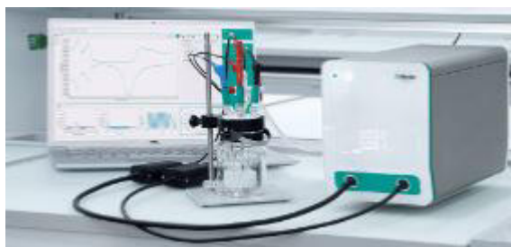
Figure 1. VIONIC powered by INTELLO.

The hydrogen permeation experiment was conducted with two VIONIC powered by INTELLO instruments from Metrohm Autolab ( Figure 1 ).