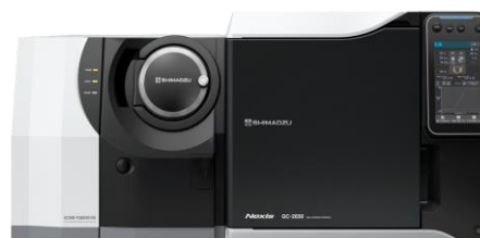
Fig. 3 Shimadzu GCMS-TQ TM 8040 NX