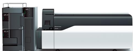
Fig. 2 Shimadzu LCMS TM -8050

All samples were analysed as per conditions shown in Table 2 and 3 for LC-MS/MS and GC-MS/MS, respectively.