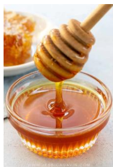
Fig. 1 Honey

The use of honey (Fig. 1) has grown and has been adopted into consumption habits due to its high nutritional value, palatable flavor, and medicinal properties. Several reports indicate the presence of pesticide residues from different classes, mainly neonicotinoid insecticides, organophosphates and pyrethroids in honey.