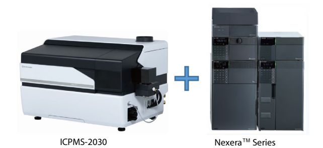
Fig. 1 LC-ICP-MS System Components

About 900 mL of purified water was added to a 1-L bottle, and then 0.85 mL of 98 wt% formic acid was added. 0.115 mL of 85 wt% phosphoric acid was added, and the mixture was diluted with purified water to make 1 L.