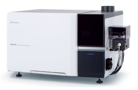
Fig. 1 ICPMS-2040 equipment

The analytical conditions used in this application can be easily registered from preset methods, enabling measurements to be performed without the need to develop them.