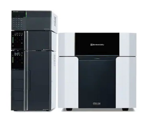
Fig. 1 PPSQ<sup>™</sup>-50A Series Protein Sequencer Isocratic System

Shimadzu PPSQ-50A series protein sequencers determine amino acid sequences based on Edman degradation. They can identify amino acid sequences in pmol levels of purified proteins. Though samples used for analysis must be purified, the process is extremely simple. For example, after proteins are separated by electrophoresis, they are electrically transferred (electroblotted) onto a PVDF membrane and dyed. Then the protein spots are excised, placed directly in the reactor, and analyzed automatically. This article describes using this system to analyze a long-chain amino acid sequence from the Nterminal.