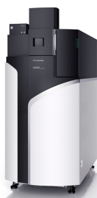
Fig. 1 Appearance of DPiMS™ QT and LCMS™-9030

This Application News introduces a new analysis technique combining the DPiMS QT which is a probe kit of electrospray ionization unit and an LCMS-9030 quadrupole time-of-flight mass spectrometer (Fig. 1) for screening of drugs in human whole blood. The DPiMS QT makes it possible to conduct direct analysis and minimize the time required from sample preparation to analysis. Use of the newly-developed iDIA measurement method makes it possible to comprehensively acquire MS/MS spectra for all ionized compounds.