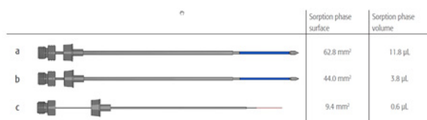
Figure 1. Dimensions of a PAL3 SPME Arrow 1.5 mm (a), 1.1 mm (b), and SPME fiber (c) in comparison.

The Agilent SPME Arrow is a new technology for microextraction, combining trace level sensitivity with high mechanical robustness.