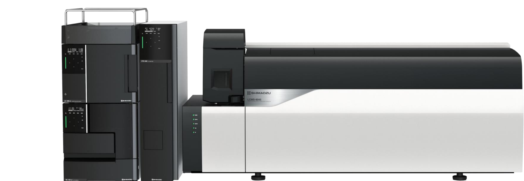
Figure 2: Shimadzu Nexera™ X3 UHPLC coupled with an LCMS-8045 Triple quadrupole.

For this study, commercially available excipient standards and biological formulations (Leuprolide acetate and Renocrit) were purchased from a local vendor. Stock solutions of all excipients were analysed in scan mode. Further, steps such as precursor ion selection, Multiple Reaction Monitoring (MRM) optimization at different Collision Energies (CE), and voltage optimization were performed using Shimadzu's LabSolutions auto MRM optimization feature to obtain MRMs and their optimum CEs (Table 2). An LC method (Table 1) was developed with an aim to separate all excipients under study which was achieved using Shimadzu Shim pack GISS C8, 75 mm x 4.6 mm I.D. and 3 μm LC column. For quantitation, six-point linearity for 7 excipients were plotted. The limit of quantitation (LOQ) were determined based on S/N ratio. The S/N ratio & % RSD at LOQ are shown in Table 3.