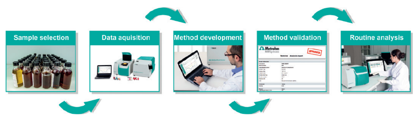
Figure 1: Workflow for the method development.

The related information can be found in scientific literature or different norms. One of the typical and clear guidelines for the development of quantitative multivariate methods for NIRS is ASTM E1655 «Standard Practices for Infrared Multivariate Quantitative Analysis» [3]. As mentioned in the second sentence of this practice, it can be applied for near-infrared spectroscopy or mid-infrared spectroscopy. As defined by ASTM the word practice «underscores a general usage principle» [4]. Therefore, it can be used for all types of quantitative applications in the area of NIRS. The workflow described in the standard practice is shown in Figure 1 and this whitepaper summarizes different steps, which are indispensable for the successful development of multivariate methods according to ASTM E1655.