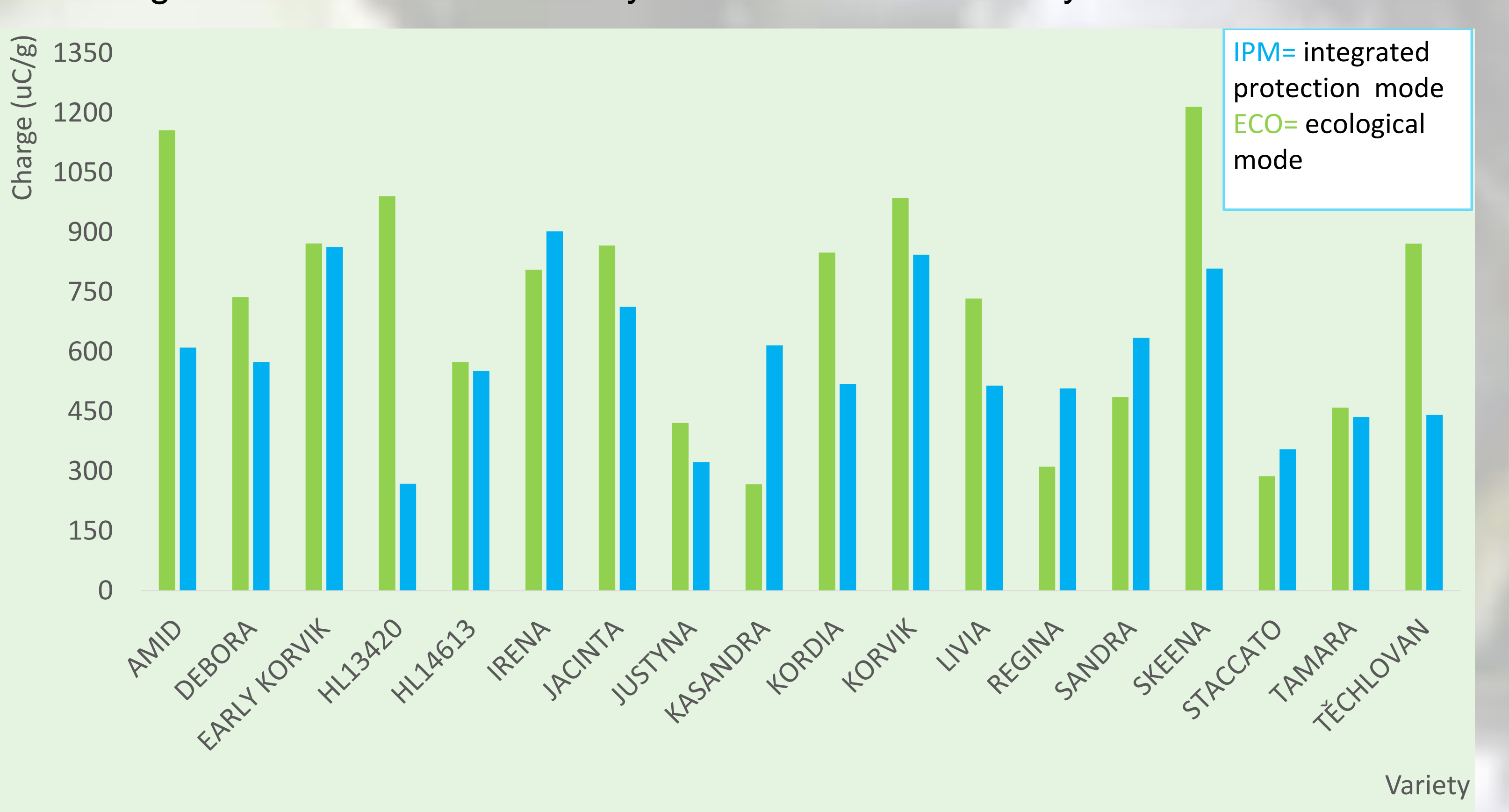
Fig.2: Comparison of total antioxidant activity in currants