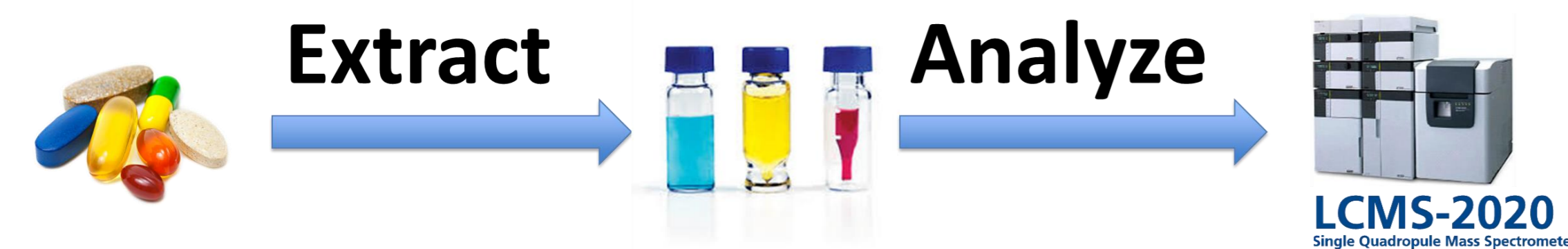
Figure 1. Graphical representation of easy sample preparation and analysis by LCMS-2020 Single Quadrupole Mass Spectrometer

Dietary protein is composed of 20 different amino acids. The consumption of amino acids individually has been proposed to enhance performance and prevent mental fatigue. Amino acids are among the top five most popular sports supplements. Different formulation types are currently available in the market such as tablets, capsules, and powders. We report here a LCMS method that can analyze all 20 L-amino acids and modified amino acids in a single analytical run in various formulations of dietary supplements.