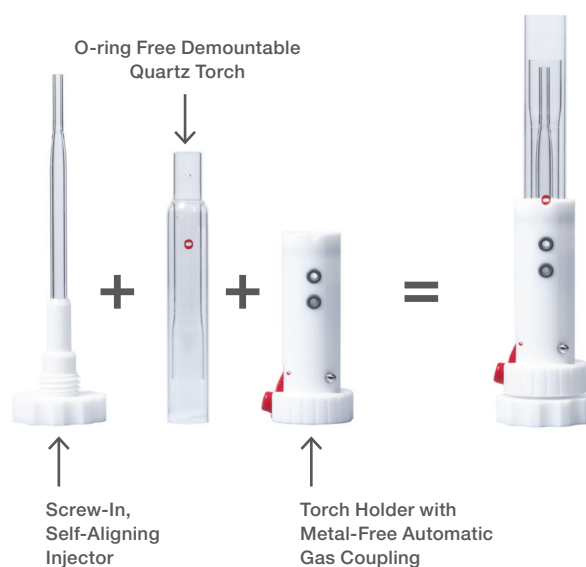
Demountable torch assembly.

Find out more at thermofisher.com/ICP-MS