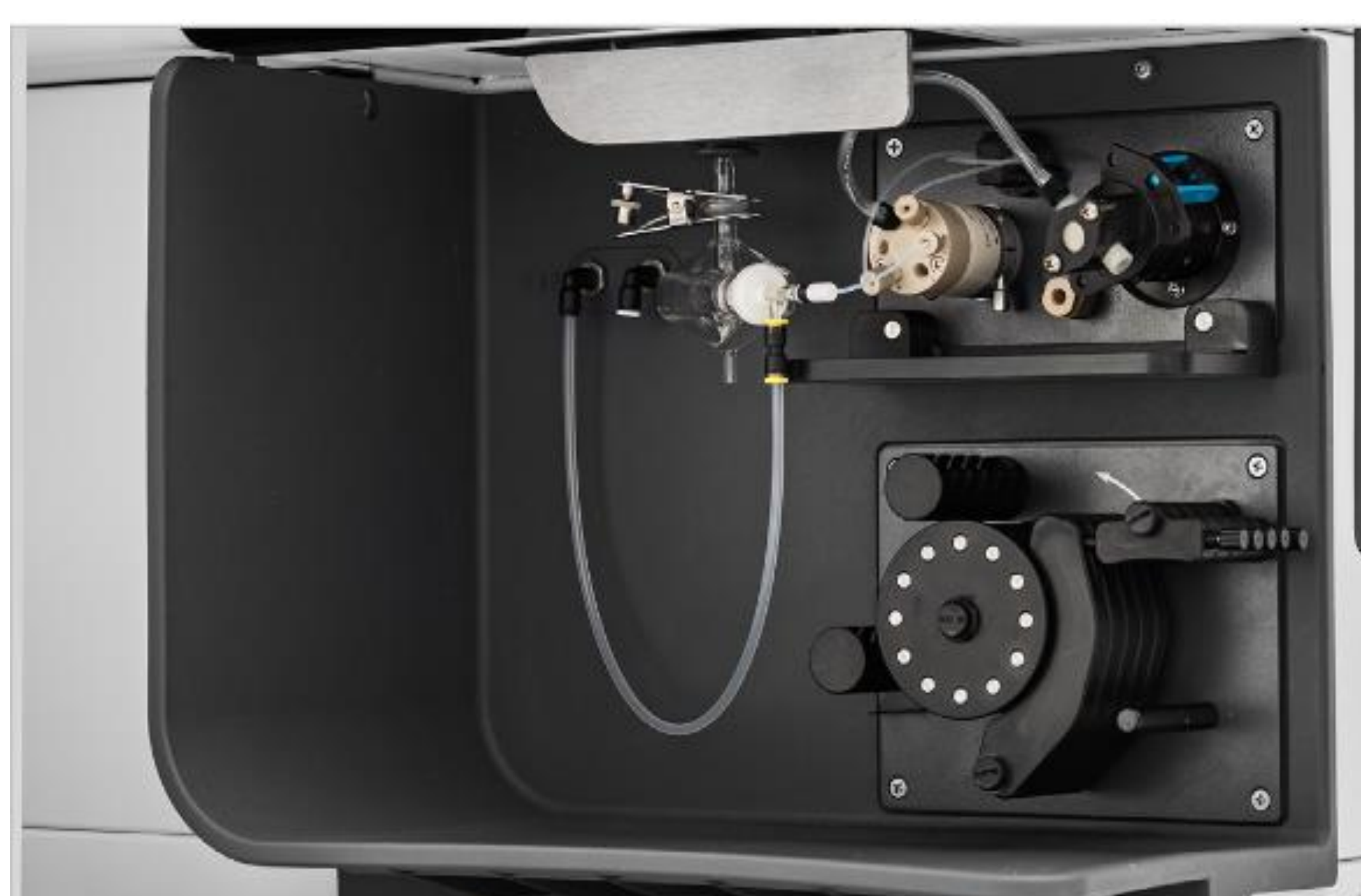
The Agilent 5110 SVDV ICP-OES fitted with Advanced Valve System (AVS) six port valve

This application note describes the ultra-high speed analysis of micronutrients Cu, Fe, Mn, Zn, Co, Ni and heavy metals Cd and Pb in a DTPA extracted soil sample using the Agilent 5110 Synchronous Vertical Dual View (SVDV) ICP-OES fitted with an integrated Advanced Valve System (AVS 6) six port switching valve.