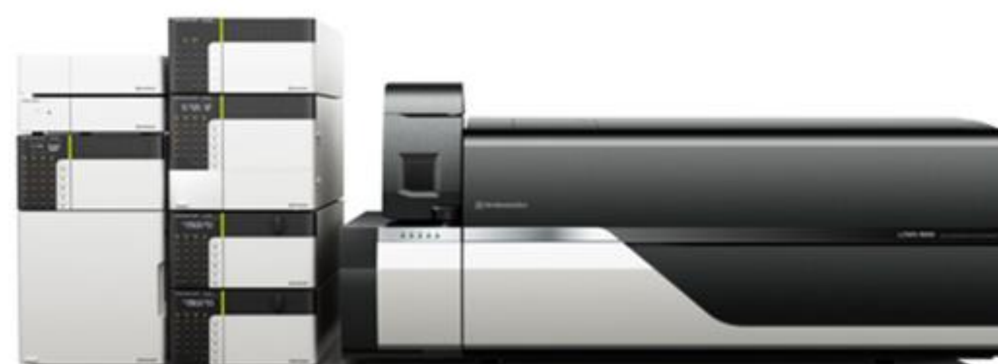
Figure 2 Nexera X2 + LCMS-8060

Ionization: ESI (Positive/Negative, MRM mode) DL temp.: 250°C HB temp.: 400°C Interface temp.: 400°C Nebulizing gas: 2.0 L/min Drying gas: 10 L/min Heating gas: 10 L/min