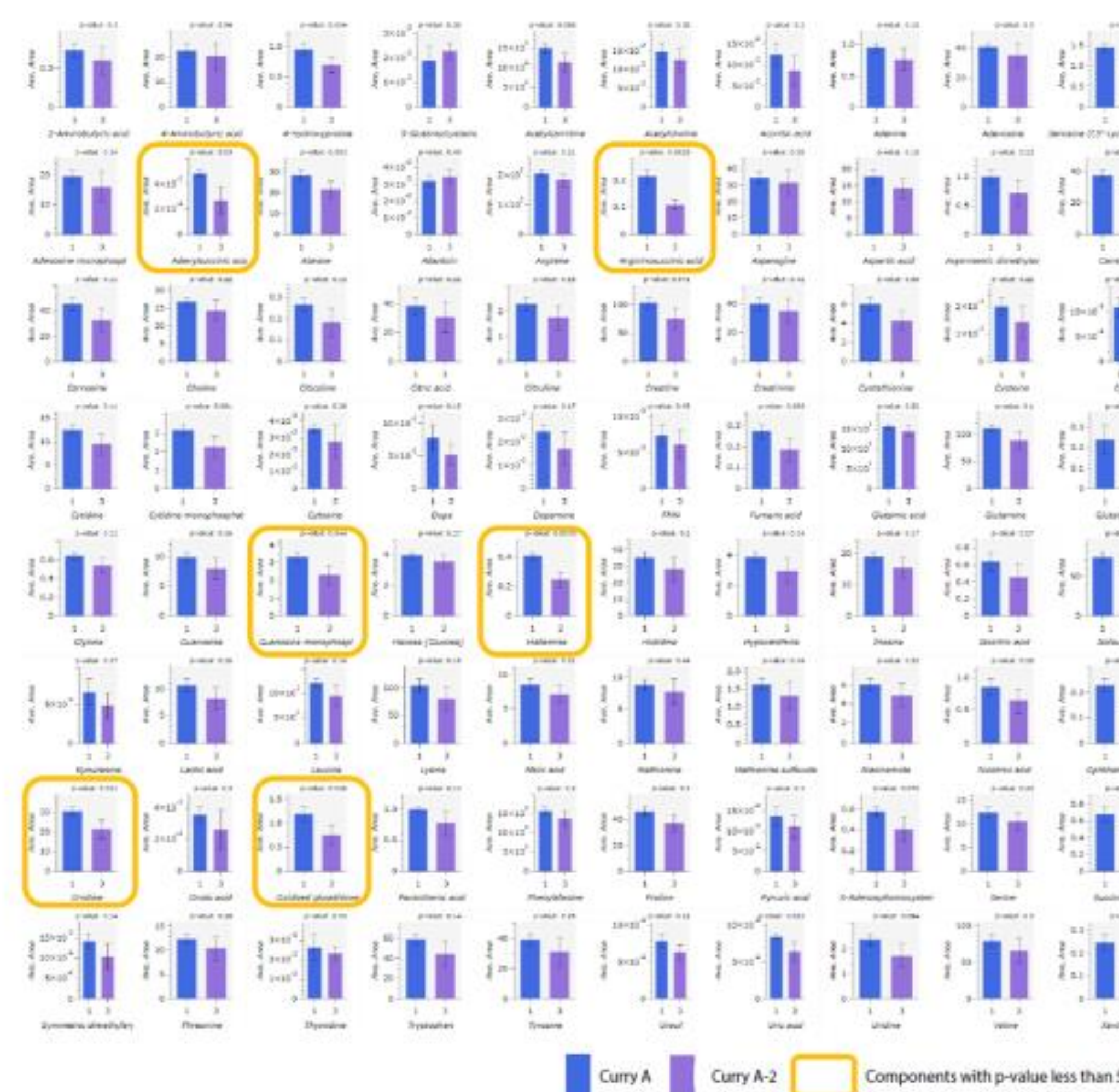
Figure 3 t-test Results for Curry A and Curry A-2

The amounts of 6 metabolites (adenylsuccinic acid, argininosuccinic acid, guanosine monophosphate, histamine, ornithine and oxidized glutathione) in Curry A sauce were obviously higher (p < 0.05) than those in Curry A-2 sauce. It was thought that there was not much elution from ingredients to sauce and change of hydrophilic compounds in sauce even if curry was stored overnight after cooking.