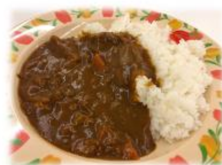
Figure 1 Curry C