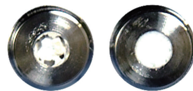
Figure 2. Pictures of the packed bed of CORTECS HILIC (left) and BEH HILIC (right) columns after high pH stability testing.

It would appear that silica particles are unstable at high pH both in reversed-phase and HILIC columns. While this is not unexpected, an in-depth look at HILIC columns had yet to be performed. Individual column stability has been examined for given assays, but columns have never been compared under standardized accelerated conditions. Based on these results, if an assay requires high pH mobile phase additives, it would be prudent to use a hybrid particle column, like the BEH HILIC or BEH Amide.