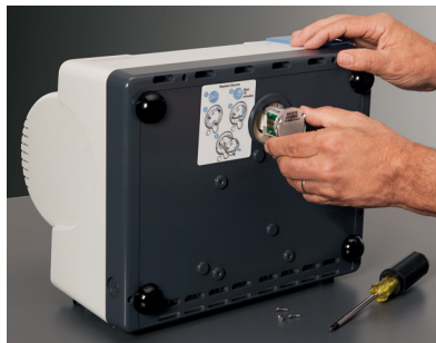
Easy, user-accessible source replacement

*KBr optics, 4 \text{cm}^{-1} spectral resolution