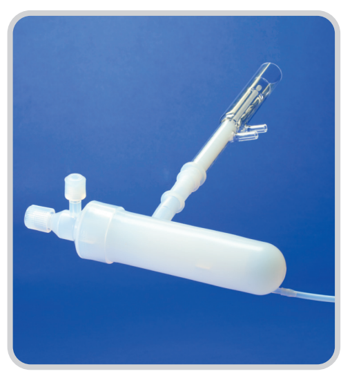
Savillex PFA Inert Kit Compatible with Agilent 7x00/8x00 ICP-MS

The Savillex PFA inert kit, compatible with Agilent ICP-MS instruments, features a Scott-type spray chamber offering excellent sensitivity, stability and washout. Designed and manufactured in-house by Savillex, from the highest purity grade PFA resin, the Savillex PFA inert kit has the lowest blank contribution of any sample introduction system. The true double pass spray chamber design filters out larger droplets, making the kit equally suited to high matrix applications (such as geological) as well as semiconductor use. In combination with one of the Savillex C-Flow PFA concentric nebulizers, the PFA inert kit can handle every type of liquid sample that can be analyzed by ICP-MS.