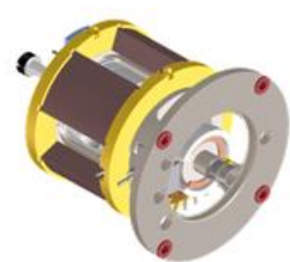
High Efficiency Source

An Agilent 7890 GC coupled to a 7010 Triple Quadrupole GC/MS system with High Efficiency Source was used. The GC system was equipped with a Multi-Mode Inlet (MMI) with air cooling and a back flushing system based on a Purged Ultimate Union controlled by an AUX EPC module. Agilent Mass Hunter Software was used for instrument control, and for qualitative and quantitative data analysis.