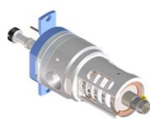
High Efficiency Source, magnet removed