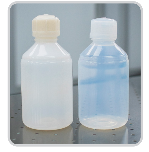
Savillex Purillex<sup>®</sup> ETFE and PFA 1 L Bottles

Most containers used to store BDS have glass transition temperatures well above -196°C; many containers structurally fail during the rapid descent through glass transition. Even worse, these failures are rarely detected until after the container is thawed, which can be days if not weeks or months after the freezing is completed.