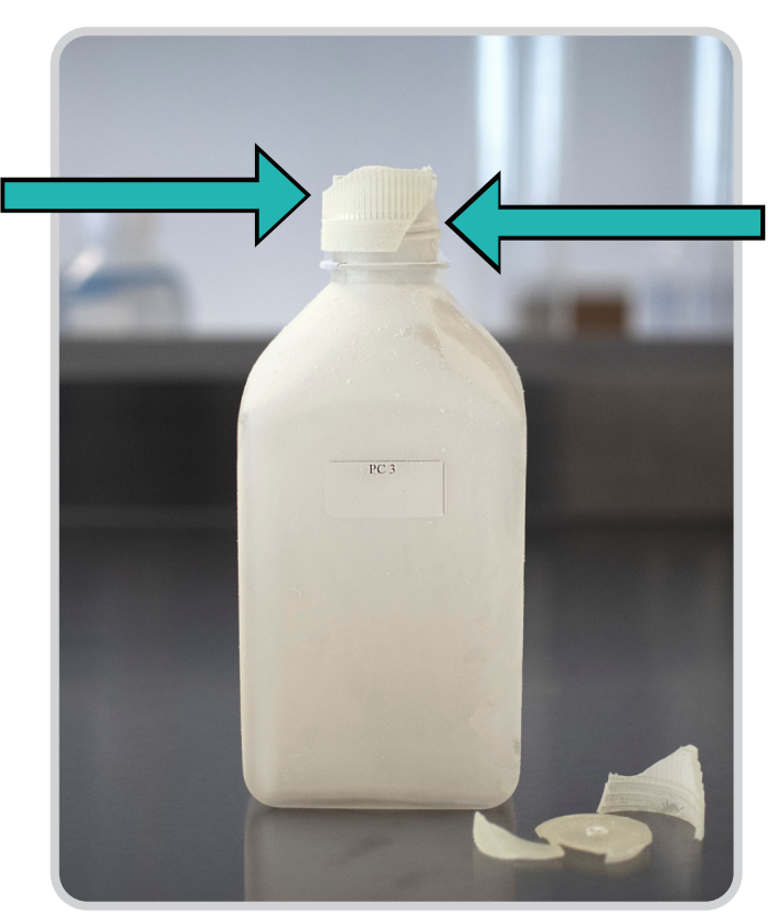
Figure 2: PC Closure Damage – Flat-on-Bottom Drop