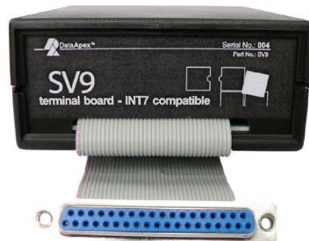
Closed Terminal Board with INT7 compatible connector

The SV9 Terminal board with easily accessible screw contacts and LED status indication is very suitable for users who will need to change the configuration of their instrument connections often or plan to use the additional digital inputs and outputs for instrument control, for example to use the digital output lines for controlling gradient, fraction collector, detector program start, detector autozero or valves switching.