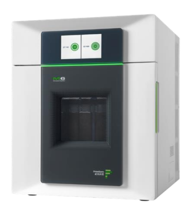
M6 microwave digestion system

The digestions were carried out with M6 microwave digestion system and HP16 high pressure digestion vessels.