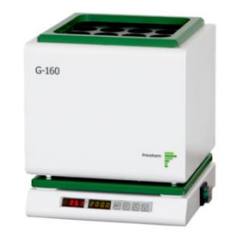
G-160 hot block