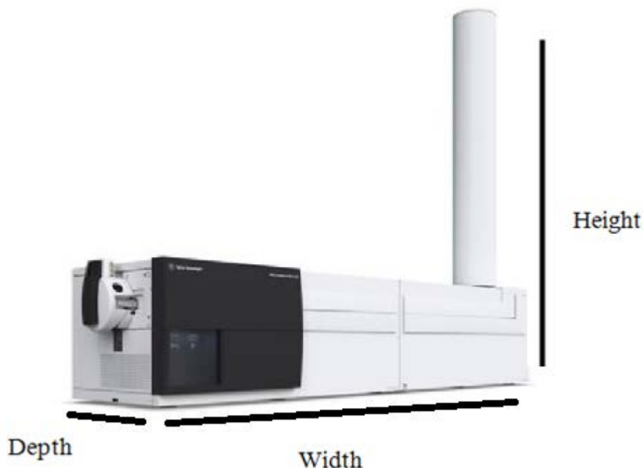
Figure 3 G6560 Ion Mobility Q-TOF LC/MS System