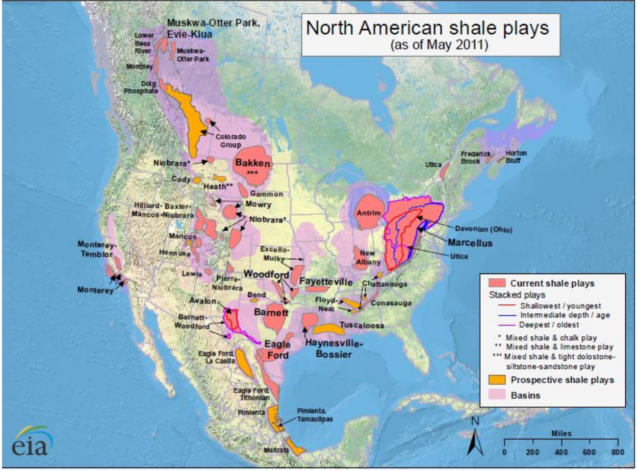
Source: U.S. Energy Information Administration based on data from various published studies. Canada and Mexico plays from ARI. Updated: May 9, 2011

The current method for determining natural gas constituents (methane, ethane, and ethene) in water is RSK 175<sup>1</sup>. This method is employed for the analysis of dissolved gases in drinking water using a headspace equilibration technique. Propane has been added to this list in modified methods such as BOL6019<sup>2</sup>, developed by the Pennsylvania Department of Environmental Protection (PADEP). This analysis also requires more modern automated headspace analyzers. A flame ionization detector (FID) will be employed for this study, although RSK 175<sup>1</sup> also allows thermal conductivity (TCD) as well as electron capture detectors (ECD) to be used. Due to the lack of EPA methods requiring headspace analysis, these instruments are not normally found in environmental laboratories. This application demonstrates an alternative analysis using purge and trap concentration, which are typically available in many environmental labs.