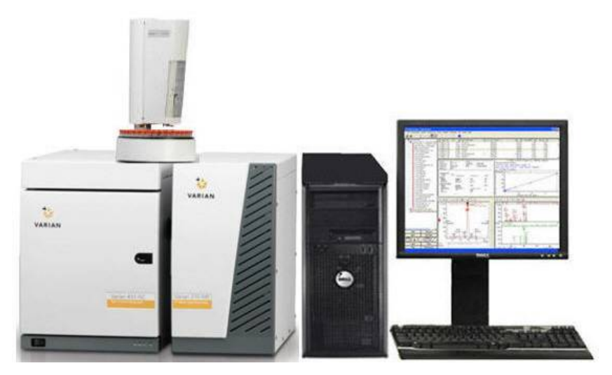
Figure 1 Layout of the GC/MS with the 431-GC

In Figure 1, the 431-GC is to the left of the MS to allow the transfer line to connect from the GC to the GC/MS. The bench must be long enough and strong enough to support the weight of the system and any additional equipment see Table 1, and Table 2. The bench must be at least 84 cm (33 in.) deep.