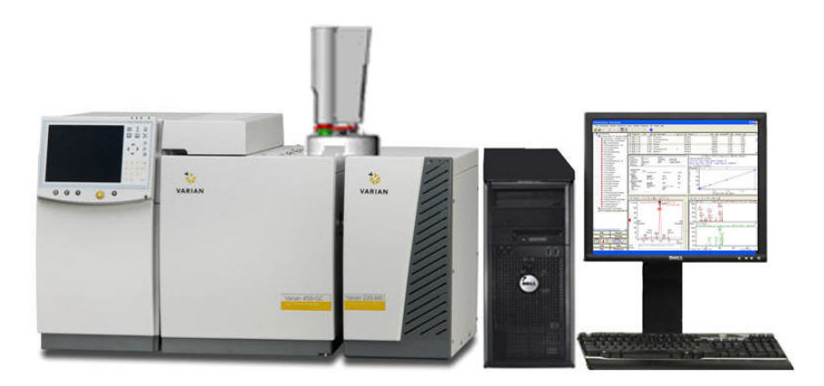
Figure 2 Layout for the GC/MS with the 450-GC

In Figure 2, the 450-GC is to the left of the MS to allow the transfer line to connect from the GC to the GC/MS. The bench must be long enough and strong enough to support the weight of the system and any additional equipment see Table 3, and Table 4. The bench must be at least 84 cm (33 in.) deep.