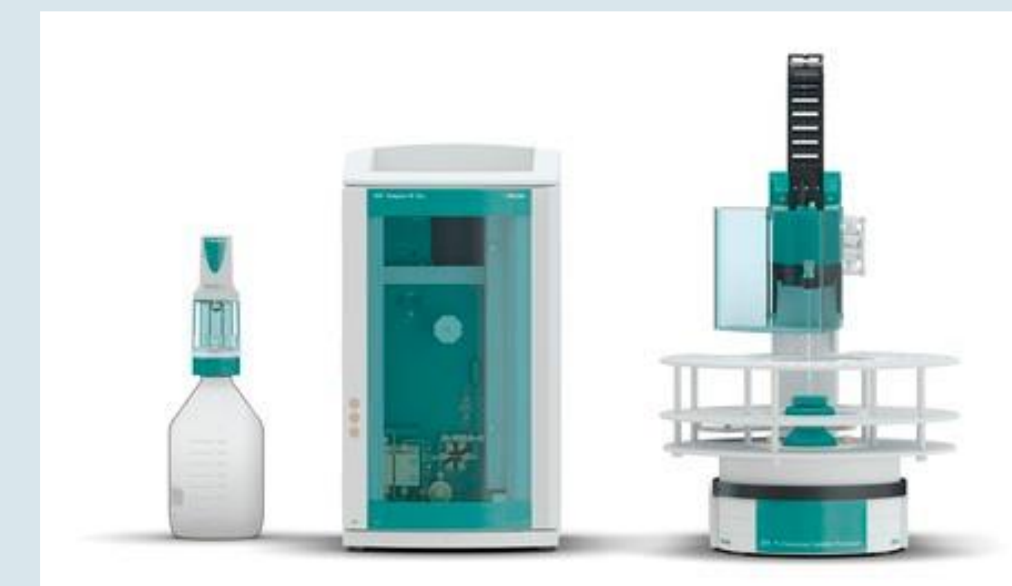
Fig 3: Ion Chromatography instrument used for drug substance impurity