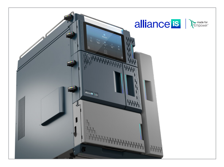
Figure 2. The Alliance iS HPLC System was designed to work with Empower Software.