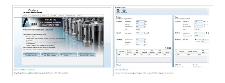
Figure 2. Waters Preparative OBD Column Calculator and the Columns calculator 2.0 online adjustment calculators ( www.waters.com).

The monograph system suitability impurities mixture (SST) was analyzed with the adjusted gradient and modernized chromatographic hardware. For all modern column dimensions, the monograph system suitability resolution requirement of NLT 1.5 for the unresolved, abacavir critical pair was successfully achieved (Figure 3). When the SST relative retention times (RRTs) were compared to those generated with the stationary phase utilized for the initial monograph separation, they were most similar for columns of the same L1 stationary phase substituents, while RRTs varied with different L1 stationary phase substituents (Figure 4). As noted in USP <621>, peak deletions and/or inversions, may be observed using various substituents, therefore chromatographic peak identity was confirmed after method adjustment by PDA spectral analysis.