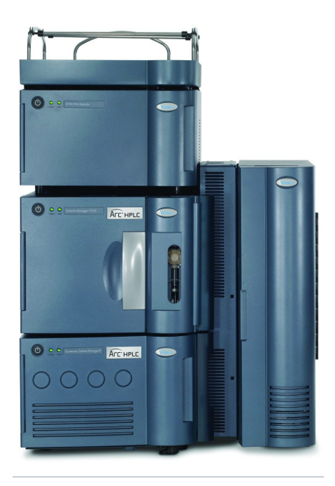
Figure 1. Arc HPLC System with PDA Detector.

a comparable separation in less time, and with less solvent consumption. Modern HPLC systems, such as the Arc HPLC System (Figure 1), extended HPLC operating backpressure limits, provide dependable flexibility when adjusting monograph methods to suit modern column hardware dimensions.