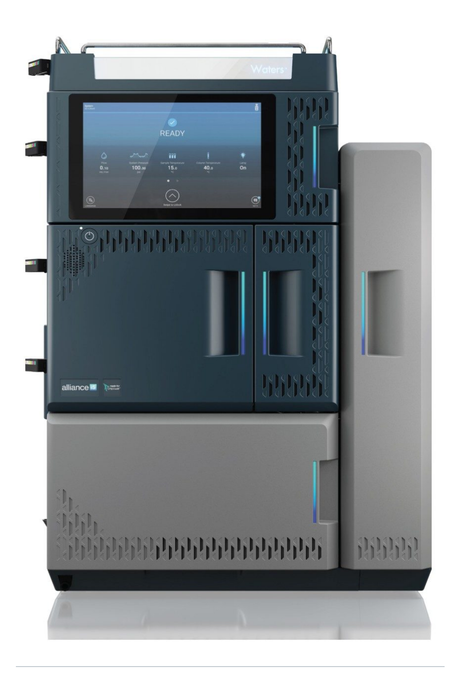
Figure 1. Alliance iS HPLC System with Tunable UV Detector.

flexibility when adjusting monograph methods to suit modern column hardware dimensions.