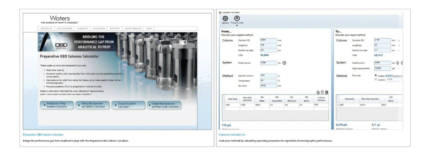
Figure 2. Waters Preparative OBD Column Calculator and the Columns Calculator 2.0 online method adjustment calculators (www.waters.com).

monograph, added confidence that the adjusted methods would not exceed the 10,000-psi backpressure limit of the Alliance iS HPLC System.