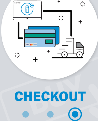
place with Waters, then the