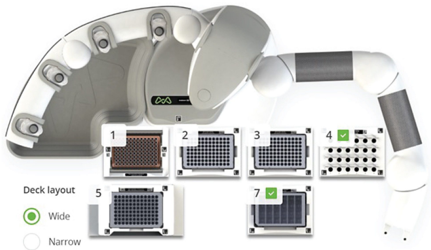
Figure 1. Andrew+ pipetting robot deck layout.