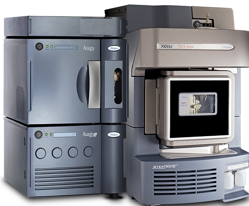
Figure 1. The Waters ACQUITY UPLC I-Class with FL System and Xevo TQ-S micro Mass Spectrometer.

Here we describe a clinical research method using a simple and fast protein precipitation of a small volume of human whole blood. Chromatographic elution using a Waters™ ACQUITY™ UPLC™ HSS C 18 SB Column on a Waters ACQUITY UPLC I-Class with FL System was completed within 1.5 minutes. Simultaneous analysis of all four analytes, followed by detection on a Xevo™ TQ-S micro Mass Spectrometer (Figure 1) was achieved with a time of under two minutes from injection-to-injection.