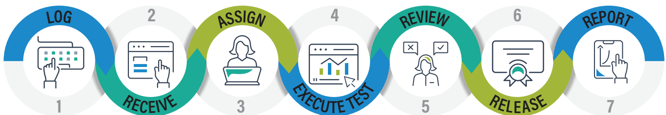
Figure 1. NuGenesis LMS for Sample Management facilitates the entire sample workflow, enhancing productivity and ensuring data integrity throughout the process. All actions can be controlled based on a user's role in the system.