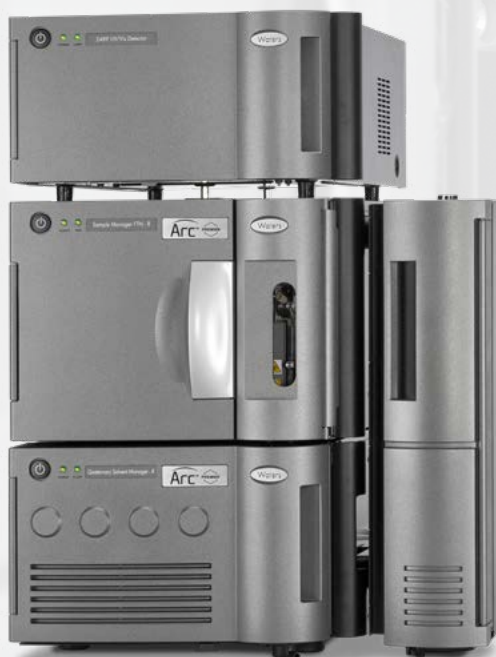
Systems optimized for 2.5–5.0 \mu\text{m} column chemistries for flexible legacy and complex sample analysis.

Future-proof your lab for next-generation compound analysis and method transfer with the Arc Premier System and MaxPeak High Performance Surfaces (HPS) Technology. With Arc Premier Systems and MaxPeak HPS Columns, you can sharpen peak shapes for metal-sensitive compounds and improve data quality – for better reproducibility and precision.