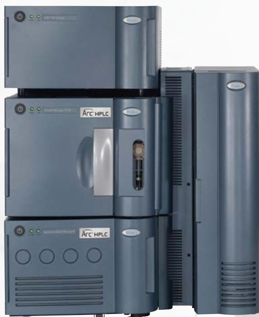
Systems optimized for 3.5–5.0 \mu\text{m} column chemistries for the time tested, dependable HPLC methods.

Maintain data quality without revalidating your existing methods with the Arc HPLC System. Count on the Arc HPLC System for high precision and reproducibility, so you can meet your regulatory requirements with confidence.