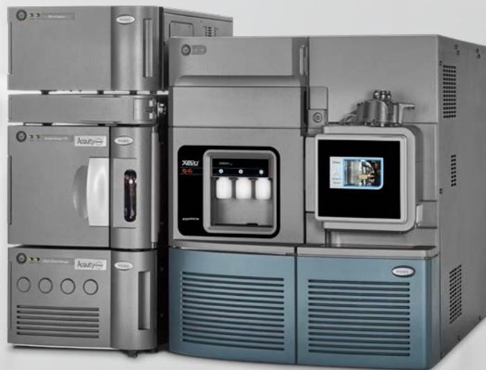
Systems optimized for sub 2 \mu\text{m} column chemistries for the highest in chromatographic performance.

Improve peak shape and reproducibility for virtually all metal-sensitive compounds with the next evolution of ultra-low dispersion, high resolution UHPLC technology: the ACQUITY Premier System and Columns with MaxPeak™ HPS Technology. Pair with the Xevo TQ-XS System to confirm the broadest range of compounds in the most complex samples or higher confidence in your results.