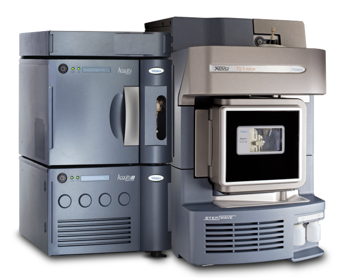
Figure 1. The Waters ACQUITY UPLC I-Class/Xevo TQ-S micro System.

Here we describe the use of the Kairos Amino Acid Kit for analysis of 45 amino acids in solution. Chromatographic separation was performed using an ACQUITY UPLC I-Class System using a CORTECS UPLC C<sub>18</sub> Column, followed by detection on a Xevo TQ-S micro System (Figure 1). Performance of the kit and analytical system was assessed in solution, in addition, NIST SRM 2389a material and matrix samples (urine and plasma) were analyzed for biomedical research purposes.