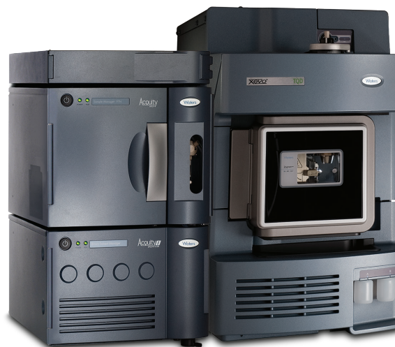
Figure 1. The Waters ACQUITY UPLC I-Class and Xevo TQD.

It has previously been demonstrated that Oasis PRiME HLB Solid Phase Extraction (SPE) has been suitable for extracting steroid hormones from serum samples. 1 This application note describes a clinical research method utilizing Oasis PRiME HLB \mu Elution Plate technology for the extraction of 17-OHP, which was automated using a liquid handler – the Tecan Freedom EVO® 100/4. Chromatographic separation was performed on an ACQUITY UPLC I-Class System using an ACQUITY UPLC HSS T3 VanGuard pre-column and an ACQUITY UPLC HSS T3 column, followed by detection on a Xevo TQD Mass Spectrometer (Figure 1). In addition, we have evaluated External Quality Assessment (EQA) samples for 17-OHP to evaluate the bias and therefore suitability of the method for analyzing 17-OHP for clinical research.