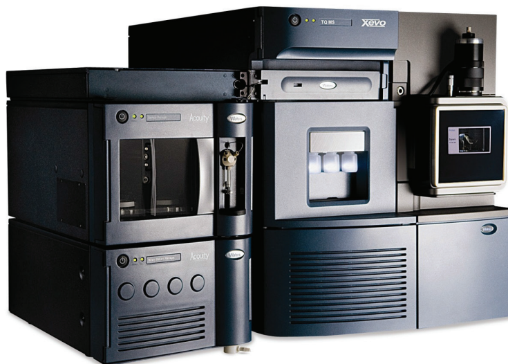
Figure 1. ACQUITY UPLC and Xevo TQ MS Detector

Measurement of 17-hydroxyprogesterone (17-OHP) by immunoassay is prone to analytical interference arising from cross-reactivity of reagent antibodies with structurally-related steroid metabolites. 1 The dried bloodspot (DBS) has proved popularity as a sample matrix in the pharmaceutical, life sciences and clinical research arena due to simplicity of sample collection and stability of compounds within this matrix. A method for the extraction and UPLC-MS/MS analysis of DBS 17-OHP using the ACQUITY UPLC System with the Xevo TQ MS Detector (Figure 1) is described. The technique features an extended LC gradient to allow qualitative evaluation of the androstenedione (A4) and cortisol chromatographic peaks.