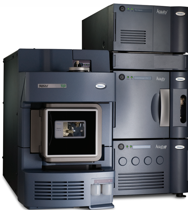
Figure 1. ACQUITY UPLC H-Class System with Xevo TQD.

The ACQUITY UPLC H-Class System enables a streamlined approach to multiple method analysis.