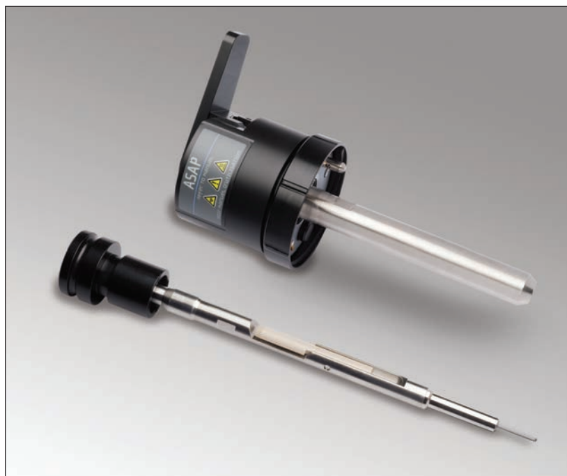
Figure 1. The Xevo Atmospheric Solids Analysis Probe (ASAP).

Xevo ® TQD with ASAP provides a rapid and easy screening method for disperse dyes.