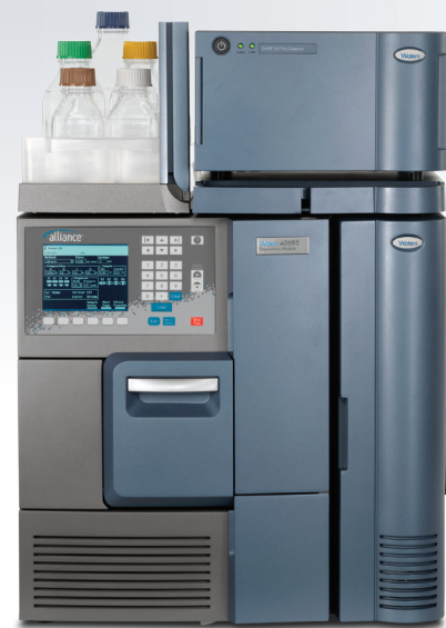
Figure 1. Alliance HPLC System with 2489 UV/Vis Detector.

The Alliance HPLC System is ideally suited for quality control laboratories that require a robust and reliable HPLC system for monitoring the quality of pharmaceutical products.