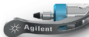
Figure 2. Agilent InfinityLab Quick Connect fitting.

An incorrectly installed column can lead to peak tailing, peak broadening, split peaks, and carryover. Sometimes, faulty connections can also cause damage to the column. InfinityLab Quick Connect and Quick Turn fittings (Figure 2) simplify installation, ensuring a dead-volume-free column connection up to 1300 bar. These fittings reduce the failure rate during column exchange and decrease associated costs caused by destroyed columns.