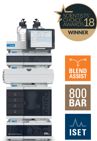
Figure 1. The 1260 Infinity II LC has received the 2018 Scientists' Choice Award for Best New Separations Product.

This white paper illustrates how the new capabilities of the 1260 Infinity II Prime LC can sum up to over 80,000 USD of incremental economic value per year compared to a conventional LC system. This economic value includes the following aspects: 1) reduced cost of operation; 2) reduced downtime; 3) more samples per day; and 4) the utilization of one system for many methods. This white paper can serve as a resource for lab managers while calculating the financial benefit of replacing their current instrumentation with the 1260 Infinity II Prime LC.