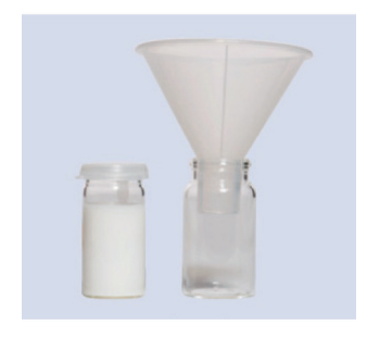
Figure 2. ECAC Standard 3 Type A kit available.