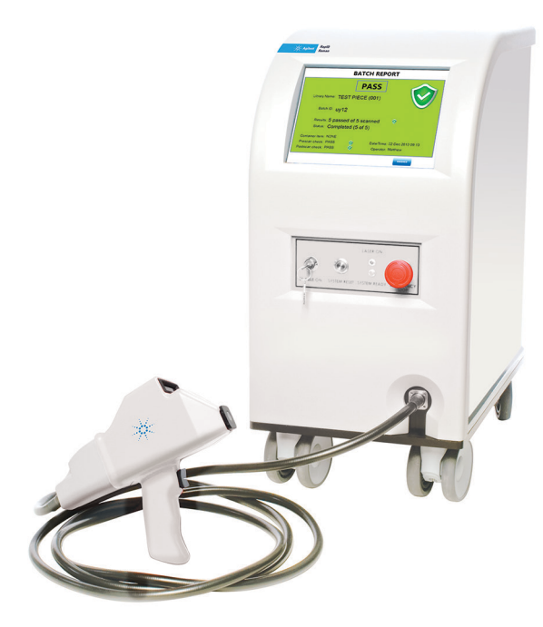
Agilent RapID Raman system.

Other liquid excipients such as ethanol, glycerol, and 1,2-propanediol may be supplied in plastic barrels. These materials are difficult or impossible to analyze spectroscopically by near infrared (NIR) or conventional handheld Raman instruments. Figure 1B shows the spectra obtained through opaque plastic barrels.