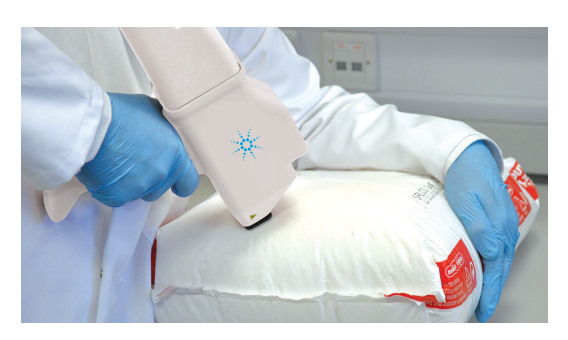
Figure 2. Verification through a nontransparent plastic sack.

Table 1. Solid materials identied through their container using anAgilent RapID system.