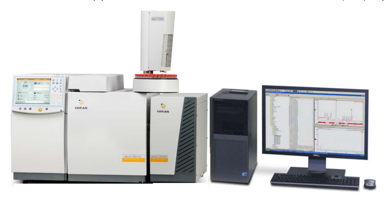
Figure 2 Layout for the GC/MS with the 450-GC

In Figure 2 the 450-GC is to the left of the MS to allow the transfer line to connect to the GC/MS. The bench must be wide enough and strong enough to support the weight of the system and additional equipment see Table 3 and Table 4. The bench must be at least 84 cm (33 in.) deep.