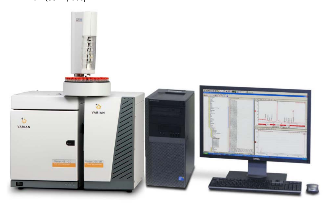
Figure 1 Layout of the GC/MS with the 431-GC

In Figure 1, the 431-GC is to the left of the MS to allow the transfer line to connect from the GC to the GC/MS. The bench must be wide enough and strong enough to support the weight of the system and any additional equipment see Table 1, and Table 2. The bench must be at least 84 cm (33 in.) deep.