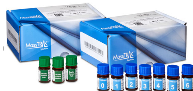
Figure 1. The MassTrak Immunosuppressant Calibrator and Quality Control Sets